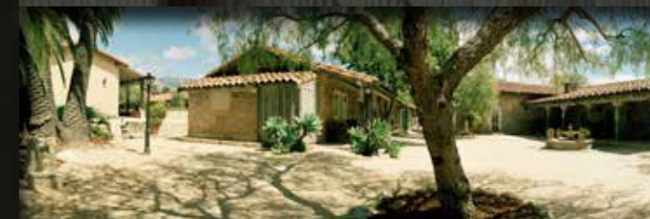
HISTORIC ADOBE (1825) & COVARRUBIAS ADOBE (1817)

TOURS OF THE FERNALD MANSION ARE AVAILABLE ON SATURDAYS BY APPOINTMENT